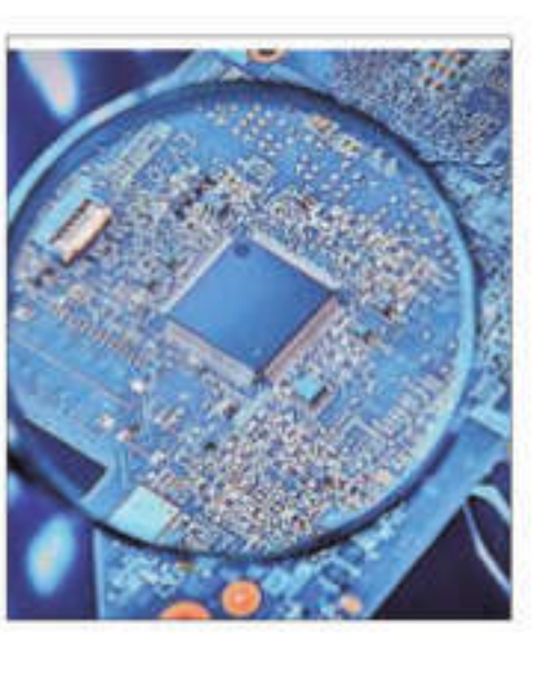
Japanese export controls.

Toyota is among the most important companies in Japan and is deeply involved in the country's chip policy, partly reflected by the fact that it has invested in a new chip campus being built by Taiwan Semiconductor Manufacturing in Kumamoto, according to one of the people. That makes it concerns a major consideration for Japanese officials, in addition to those of Tokyo Electron, the semiconductor gear-maker that would be principally affected by any new